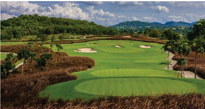
#3 Best of Pattaya Golf Prize includes 3 rounds of golf, 4 nights Deluxe Hotel and all airport & golf transfers for 2 persons.