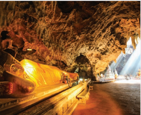
Ancient City of Petchaburi Tour (6 hrs) Monday or Tuesday Meet at Centara Lobby: 9:00am & 11:00am

Explore the majestic Khao Luang Cave with its golden Buddhas and limestone formations. Visit Wat Pra Sri Mahathat, then stroll Khao Wang Palace, King Rama IV's summer retreat, offering sweeping views of Petchaburi. Lunch included.