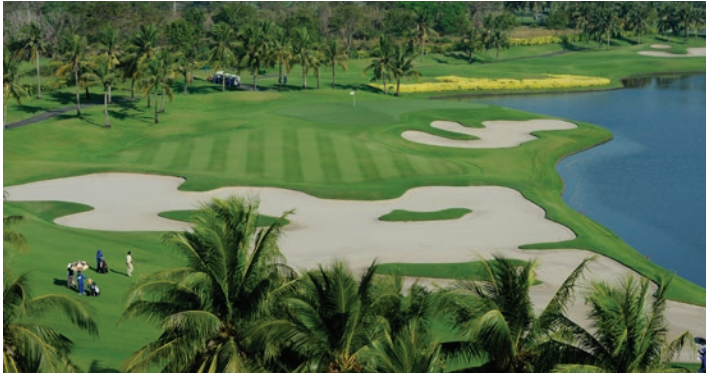
#4 Best of Bangkok Golf Prize includes 3 rounds of golf, 4 nights Deluxe Hotel and all airport & golf transfers for 2 persons.