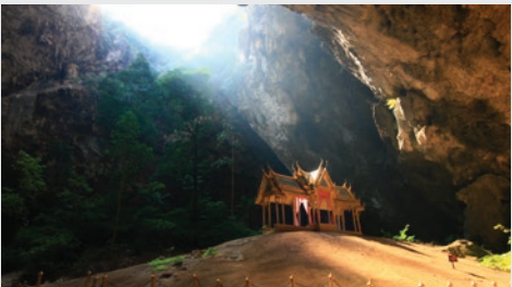
Sam Roi Yod & Cave Tour (7 hrs) Depart Centara: 9:00am Cost: THB 2,900

Discover the wild beauty of Sam Roi Yod—land of “300 peaks.” After a scenic drive, hike through rugged terrain to reach a majestic cave where sunlight streams onto a hidden pavilion. After your trek, enjoy a tasty local lunch and unwind with a serene boat ride on Lotus Lake, home to birds and blooming lilies. Moderate fitness required.