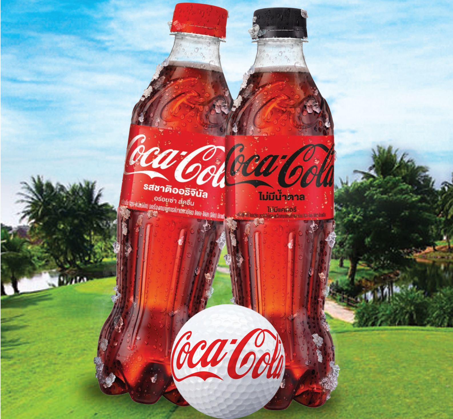
©2024 The Coca-Cola Company.