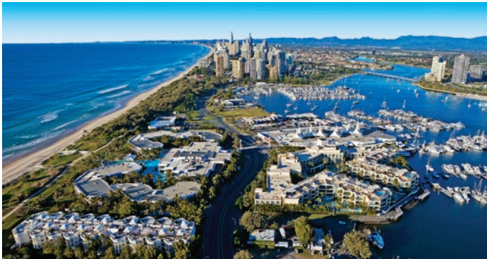
#2 One entry to the Gold Coast World Masters Golf Championship, from October 2025 Prize includes tournament entry package, 7 nights at Meriton Gold Coast Resort, daily golf transfers.