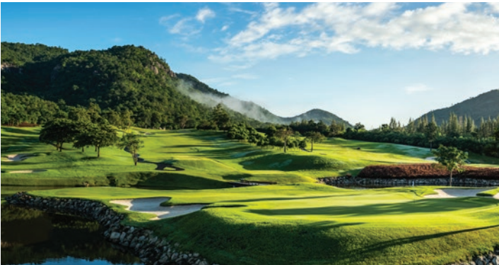
#1 One entry to the 2026 Centara World Masters Golf Championship Prize includes tournament entry package, 6 nights at the 5 star Centara Grand Beach Resort, daily golf transfers.

Prizes Drawn at The Gala Presentation Dinner Friday 13 th June