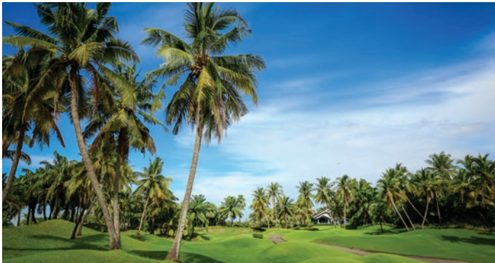
#6 US$ 150 Travel Voucher US$ 150 Travel Voucher which you can use against any Stay & Play or Golf Tournament Package with Go Golfing or Golfasian.