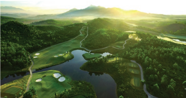
#5 US$ 250 Travel Voucher US$ 250 Travel Voucher which you can use against any Stay & Play or Golf Tournament Package with Go Golfing or Golfasian.