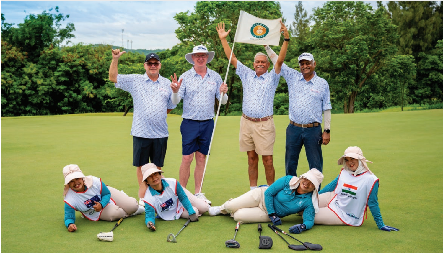
10 Centara World Masters Golf Championship June 2025