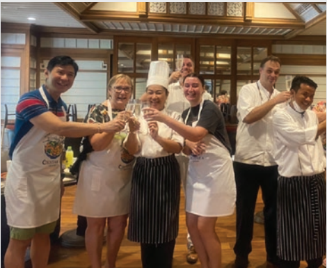
Thai Cooking Class (3 hrs) Monday or Tuesday Meet at Centara Railway Restaurant: 9:00am & 11:00am

Add spice to your stay with a fun, hands-on cooking class. In teams, plan a menu, shop with a budget, and prepare Thai dishes under the guidance of a local chef. Wrap up by sharing your creations in a group feast.