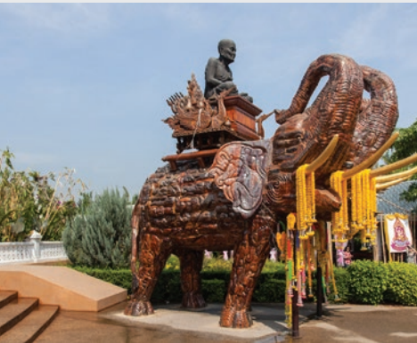
Hua Hin Historical Tour (6 hrs) Monday or Tuesday Meet at Centara Lobby: 9:00am & 11:00am

Dress: Comfortable attire, walking shoes