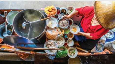
Floating Market Tour (6 hrs) Depart Centara: 7:30am Cost: THB 2,600

Dress: Comfortable attire, modest for temples