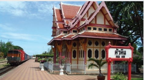
Hua Hin Historical Tour (6 hrs) Depart Centara: 9:00am Cost: THB 1,900

Dress: Comfortable attire and walking shoes recommended